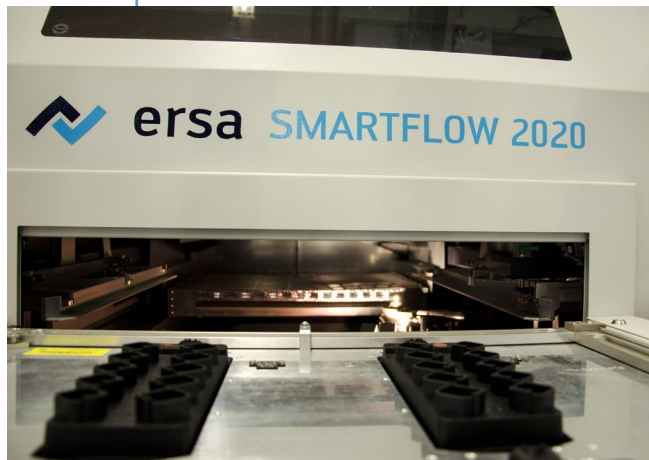
○ View of equipped product carriers in the SMARTFLOW process chamber.