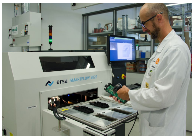
Ersa SMARTFLOW 2020 with customer-specific connection to the MES system.